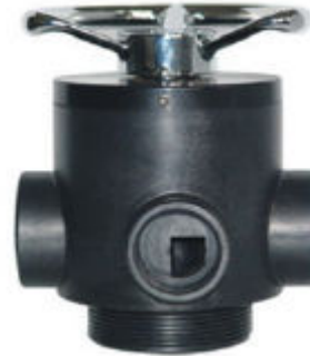
F56D 2" manual filter valve

Technical Parameters: Maximum pressure: 115 psi Water temperature: 34°F – 175°F Water capacity: 20 gpm Tank diameters: 6" – 12" Tank connection: 2.5" Inlet/outlet: 1" FNPT Drain: 1" FNPT Riser tube: 1.05"