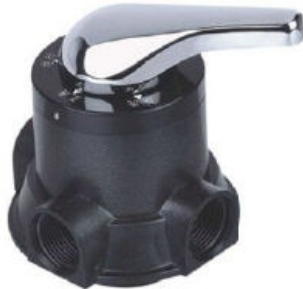
F56A 1" manual filter valve